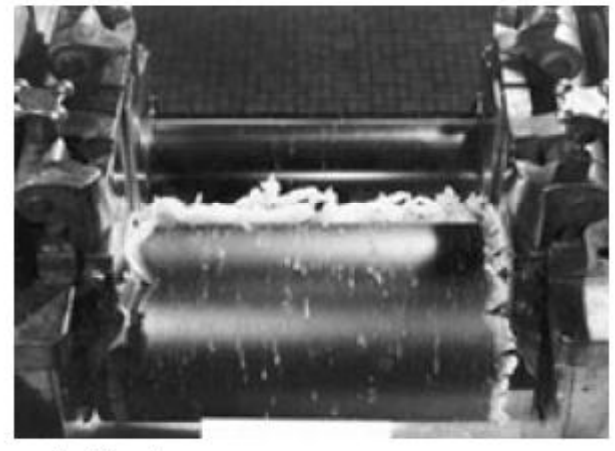
with PARALOID K-I 20ND. . .